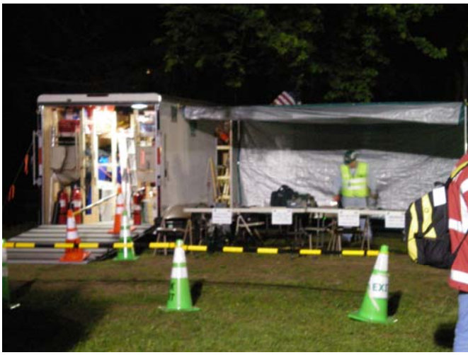
In photo at left, the Ho-Ho-Kus CERT trailer is seen alongside the Incident Command Post at a recent night operation.