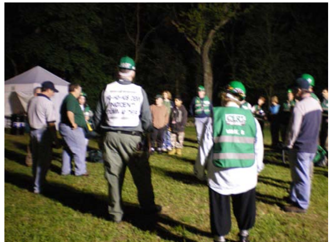
Photo at right shows Ho-Ho-Kus Incident Commander (in white vest) debriefing CERT personnel after a night time exercise

Photo at left shows Ho-Ho-Kus CERT Team Leader demonstrating at a recent daytime exercise how to make stretcher from duct tape and two poles