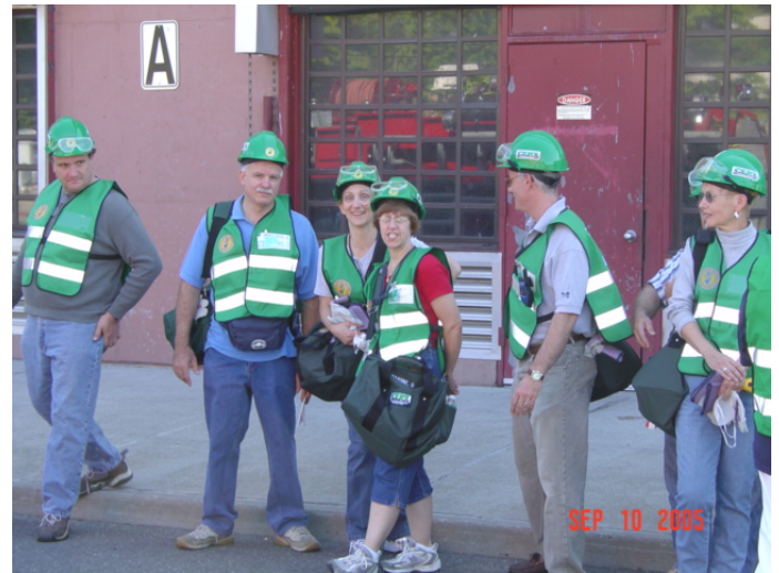
In photo at right, Ho-Ho-Kus CERT Members take a break during a County CERT Day Event at the Bergen County Law and Public Safety Institute at Mahwah, NJ.