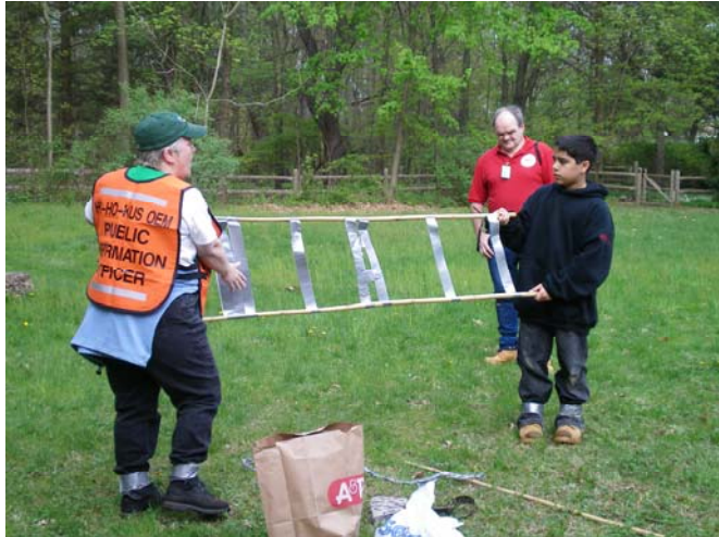
Photo at left shows Ho-Ho-Kus CERT Team Leader demonstrating at a recent daytime exercise how to make stretcher from duct tape and two poles

Photo at right shows Ho-Ho-Kus Incident Commander (in white vest) debriefing CERT personnel after a night time exercise