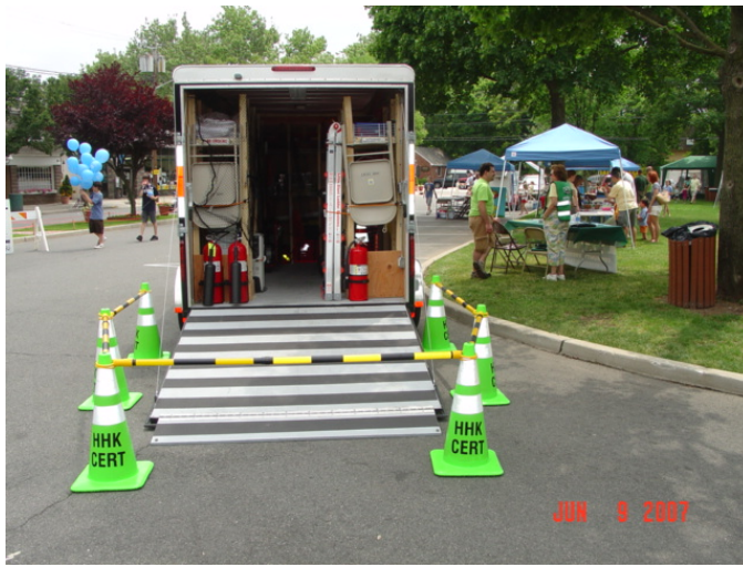
In photo at left, Ho-Ho-Kus CERT members ready the CERT Trailer and their table for a Ho-Ho-Kus Ducky Derby Day event on the Town Green.